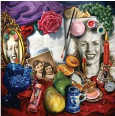
Audrey Flack, Marilyn, 1977, oil over acrylic on canvas, 96 x 96 in., UAMA, Museum Purchase with funds provided by the Edward J. Gallagher, Jr. Memorial Fund, 1982.35.1.