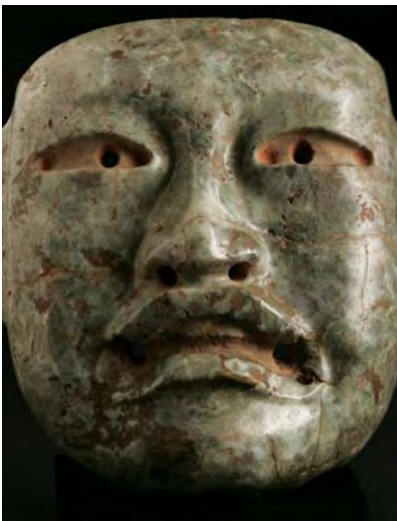
Olmec, Mexico, Human Mask , 1500-300 BC, Jadeite, 6 x 5 \frac{7}{8} x 3 in., Courtesy the I. Michael Kasser Collection