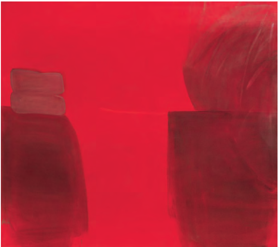
Cover: Essaouira , 2000, acrylic on canvas, 66 x 62 in., Collection of the artist Elephant Terrace , 2008, acrylic on canvas, 62 x 70 in., Courtesy of Etherton Gallery